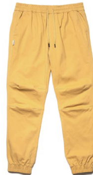
TAN • 1302004.BLK