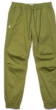
OLIVE • 1302004.BLK

Elastic waist with front facing draw cords Side slash pockets and back welt pockets Cotton twill fabric Tapered fit with elastic cinched cuff Available in: Olive, Black, Navy, Tan, Sand 97% Cotton, 3% Spandex Twill