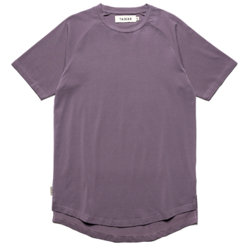
AUBERGINE • 1303001.AUB