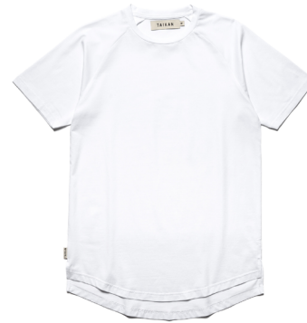
WHITE • 1303001.WHT

Lightweight jersey raglan tee Scallop bottom with elongated back 2" side split Available in White, Black, Tan, Aubergine, Burgundy 95% Cotton, 5% Spandex