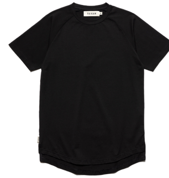
BLACK • 1303001.BLK