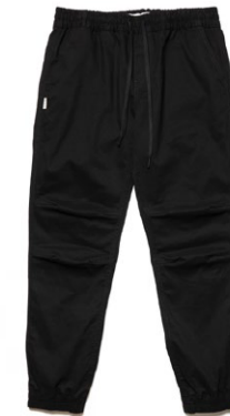
BLACK • 1302004.LMT