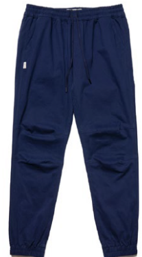
NAVY • 1302004.DKH